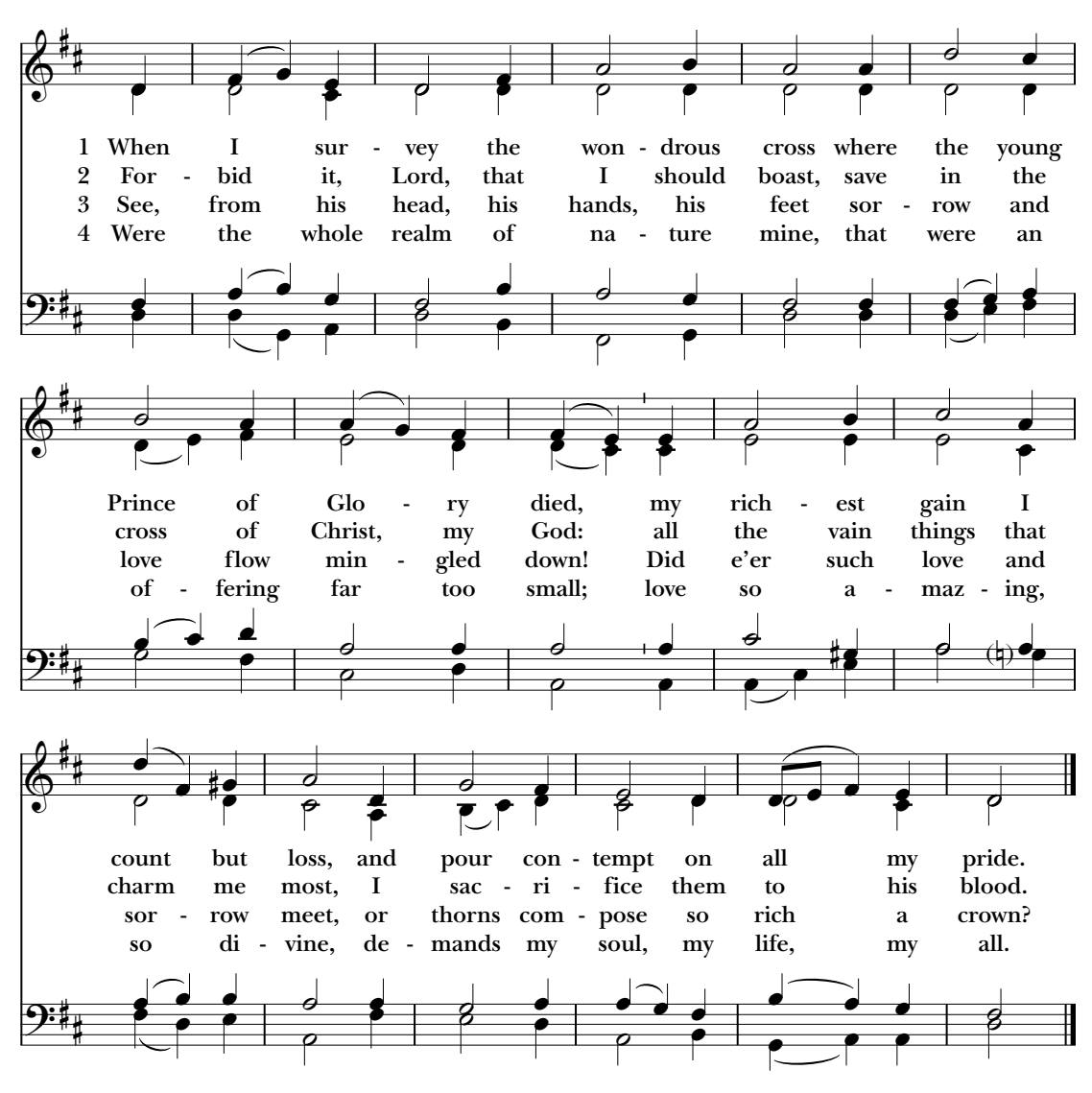
HYMN "When I survey the wondrous cross" Standing, all who are able; everyone sings.